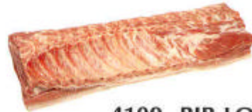
4109 RIB LOIN