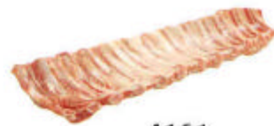
4161 LOIN RIBS