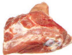
4049 SHOULDER PICNIC