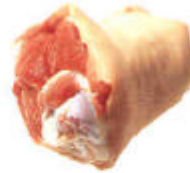
4172 HOCK LEG