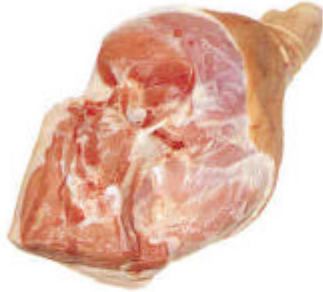
4012 LEG HAM TRIM