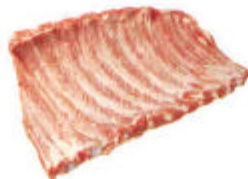
4160 SPARE RIBS